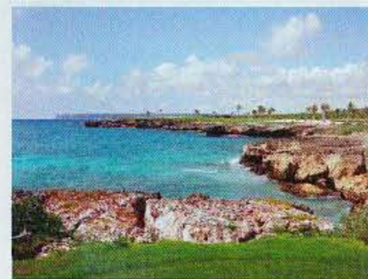
PAR FOR THE COURSE: The private Jack Nicklaus-designed golf course at Cap Cana.

On the southeastern tip of the Dominican Republic in Punta Cana, you'll find Cap Cana, a new development that's home to the spiffiest new golf course the Caribbean has seen in years. Designed by Jack Nicklaus, the Punta Espada course offers views of the ocean from almost every hole.