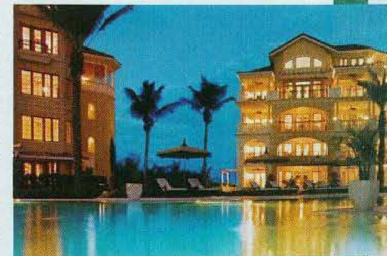
GOODNIGHT, GRACIE: A peaceful evening at the pool at The Somerset on Grace Bay.