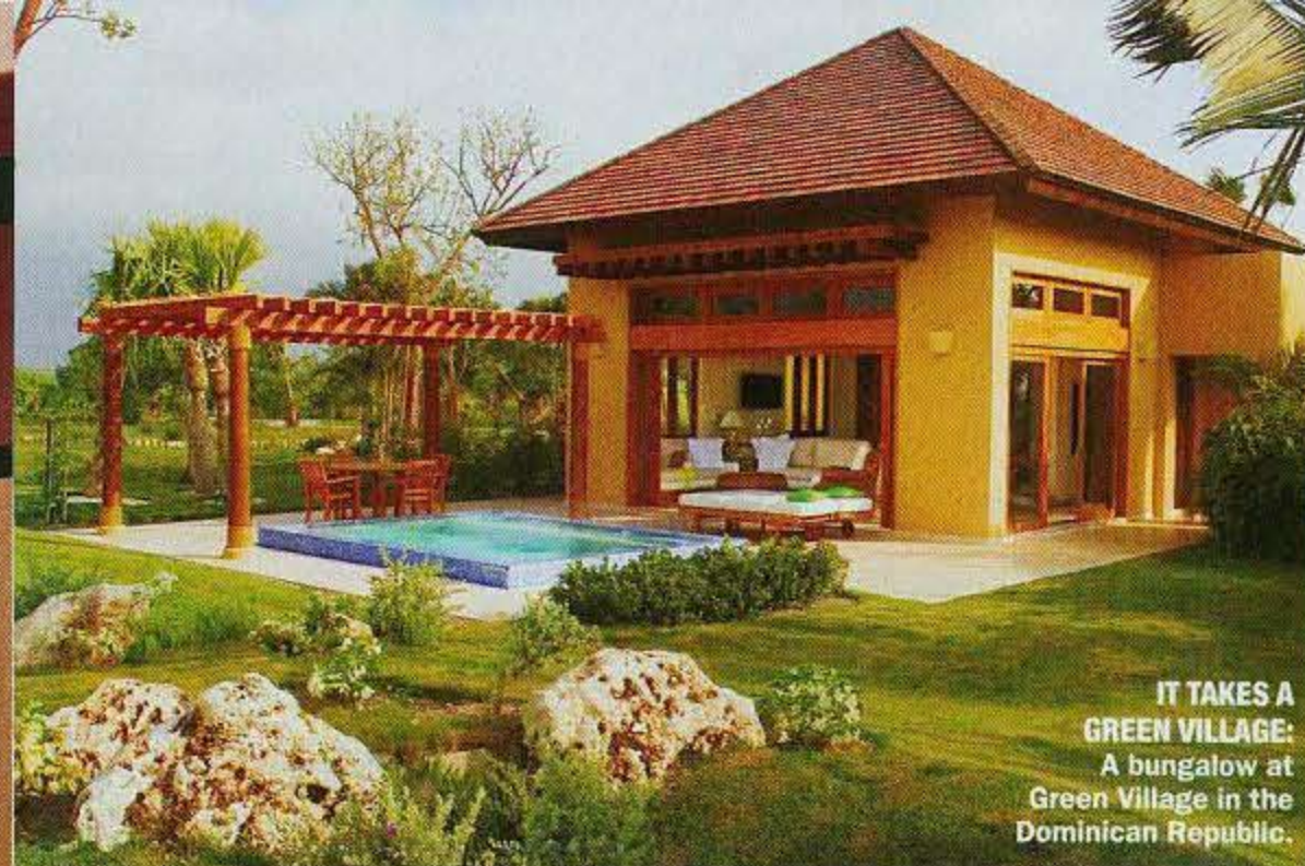
IT TAKES A GREEN VILLAGE: A bungalow at Green Village in the Dominican Republic.